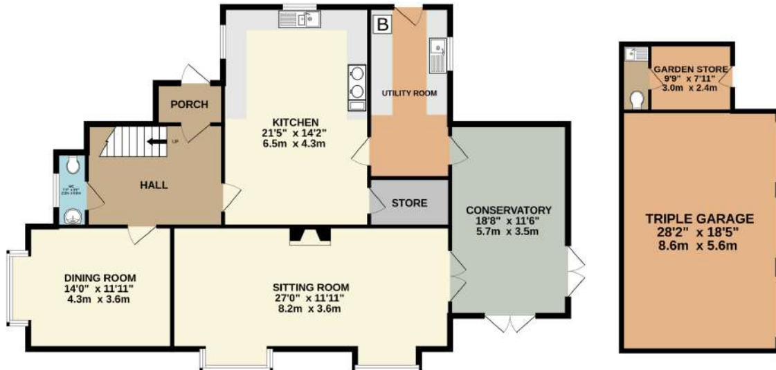
GROUND FLOOR 1385 sq.ft. (128.7 sq.m.) approx.

Castle Orchard House, Castle Orchard, Bungay, Suffolk, NR35 1DD